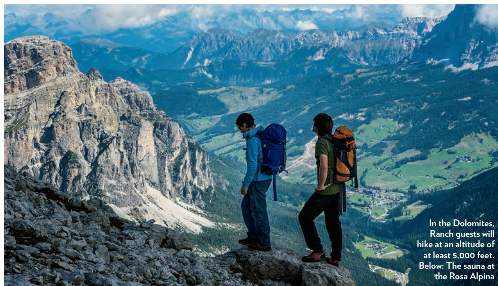
In the Dolomites, Ranch guests will hike at an altitude of at least 5,000 feet. Below: The sauna at the Rosa Alpina

The world's oldest celebration of cinema returns to the Lido. labiennale.org