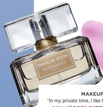
From left: Givenchy Dahlia Divin Eau de Parfum Nude, $139 (50ml); Benefit Benetint Cheek & Lip Stain, $55.

MAKEUP & FRAGRANCE "In my private time, I like to be natural, but on a shoot I want makeup!" ROSY CHEEKS: Benefit Benetint Cheek & Lip Stain. "I always wear it." BROW MUST: Laura Mercier Eye Brow Pencil. "I used to overpluck them. At my first agency in Paris, they were like, 'Girl, you gotta grow those eyebrows out!' They grew back, thank God." SIGNATURE SCENT: Givenchy Dahlia Divin Eau de Parfum Nude. "It makes me feel like a modern goddess, sensual and strong."