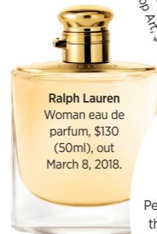
Ralph Lauren Woman eau de parfum, $130 (50ml), out March 8, 2018.