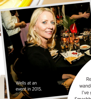
Wells at an event in 2015.