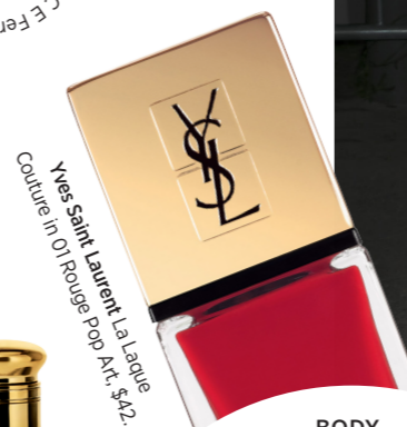
Yves Saint Laurent La Laque Couture in 01 Rouge Pop Art, $42.