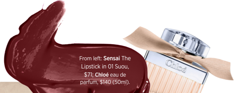
From left: Sensai The Lipstick in 01 Suou, $71; Chloé eau de parfum, $140 (50ml).