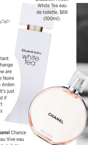
Chanel Chance Eau Vive eau de toilette, $130 (50ml).