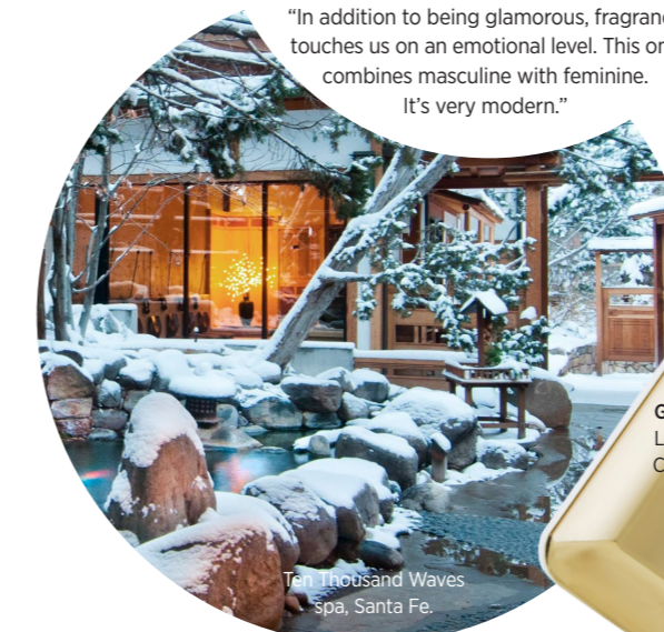
Ten Thousand Waves Spa, Santa Fe.