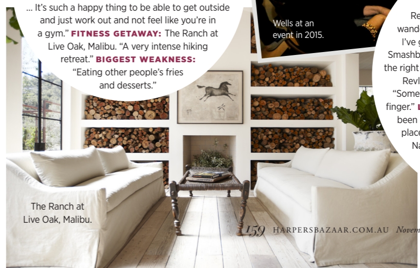
The Ranch at Live Oak, Malibu.

"When travelling, I like to try classes wherever I go. I'll take a class in Paris or LA — whatever the trendy thing is." CLASS OF CHOICE: SoulCycle, New York. "I've been going since it opened [11 years ago] ... I love what it does for my mind; it takes all my stress away. I feel like a clear thinker afterwards." ONE WITH NATURE: "I like to take a hiking vacation sometimes ... It's such a happy thing to be able to get outside and just work out and not feel like you're in a gym." FITNESS GETAWAY: The Ranch at Live Oak, Malibu. "A very intense hiking retreat." BIGGEST WEAKNESS: "Eating other people's fries and desserts."