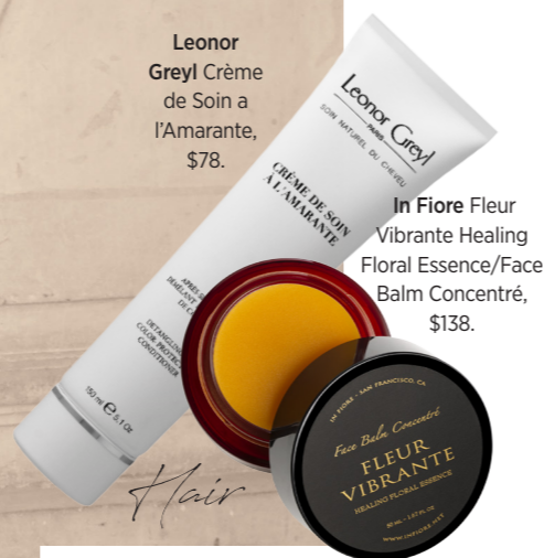
In Fiore Fleur Vibrante Healing Floral Essence/Face Balm Concentré, $138.