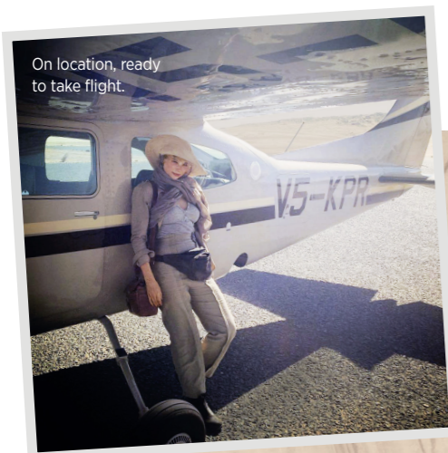
On location, ready to take flight.