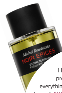
Frédéric Malle Noir Epices eau de parfum, $359 (100ml).