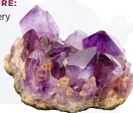
PRICES APPROXIMATE