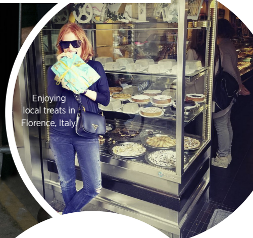
Enjoying local treats in Florence, Italy.