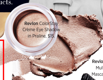
Revlon ColorStay Crème Eye Shadow in Praline, $15.

The chief creative officer at Revlon and former editor-in-chief of beauty bible Allure has never lost her hunger for trialling all of the latest and greatest beauty products.