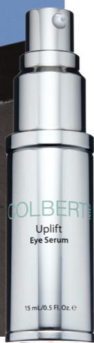
Colbert MD Uplift Eye Serum, $170.

Pureology Hydrate Sheer Shampoo and Conditioner, $35 each.