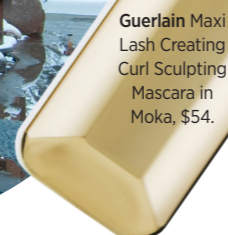
Guerlain Maxi Lash Creating Curl Sculpting Mascara in Moka, $54.