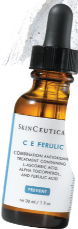
SkinCeuticals C E Ferulic serum, $160.

"I try to schedule spa weekends with my girlfriends so we can all hang out." FAVOURITE SPA SERVICES: "Massage. I love an exfoliating-wrap-massage combo. And dry brushing." GETAWAY: Ten Thousand Waves spa in Santa Fe. FEET TREAT: Pedicure booties. "I had a paraffin bootie treatment at the Shangri-La Hotel spa in Toronto, and I loved it so much I bought them for home." NAIL SHADE: Yves Saint Laurent La Laque Couture in 01 Rouge Pop Art. SIGNATURE SCENT: Woman by Ralph Lauren. "In addition to being glamorous, fragrance touches us on an emotional level. This one combines masculine with feminine. It's very modern."