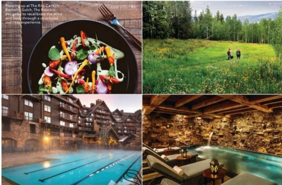
Popping up at The Ritz-Carlton, Bachelor Gulch, The Ranch is designed to recalibrate the mind and body through a structured wellness experience.