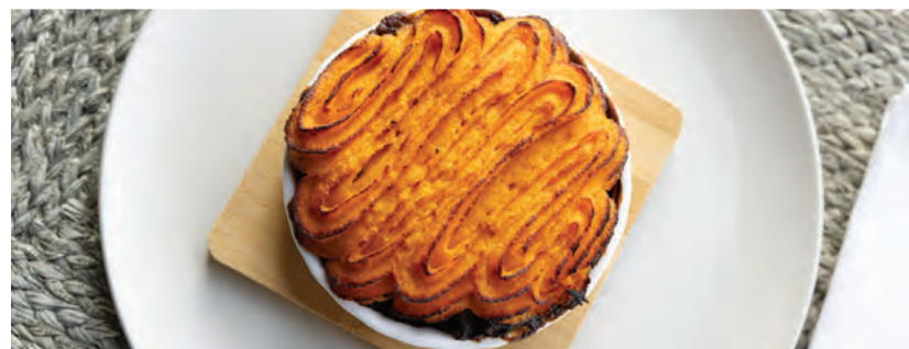
DINNER & BEDTIME