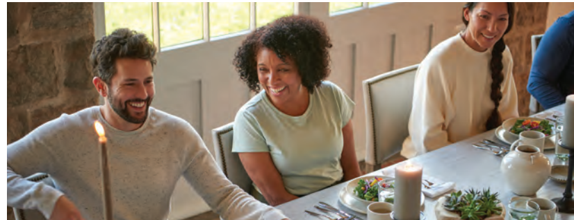
FRESHEN UP & LUNCH