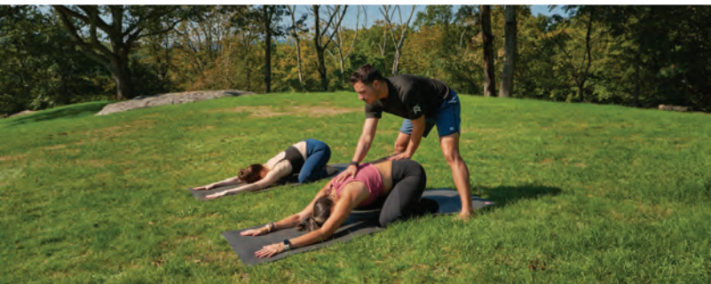
GUEST WAKE-UP & MORNING STRETCHES

FULLY CUSTOMIZABLE TO SEAMLESSLY INCORPORATE YOUR MEETING AGENDA