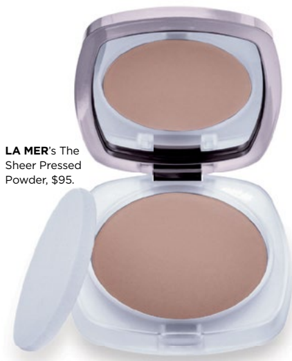
LA MER's The Sheer Pressed Powder, $95.