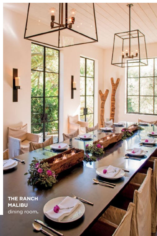
THE RANCH MALIBU dining room.

The Ranch Malibu , renowned for its luxurious, results-driven wellness retreats, is introducing The Ranch 10.0, an elongated version of the resort's seven-day signature stay, typified by delicious vegan cuisine, rigorous workouts and impressive weight-loss results. The experience begins at the Four Seasons Hotel Westlake Village for a four-day Jumpstart program, which includes medical diagnostic testing, and concludes with an off-the-grid week at The Ranch Malibu. "Guests ease into the rigorous program in the setting of a luxury hotel. By the time they get to The Ranch, which is more sequestered, they are acclimated to the nutritional and fitness program and are able to reset their minds and bodies at a deeper level," explains founder and CEO Alex Glasscock. $10,800; theranchmalibu.com.