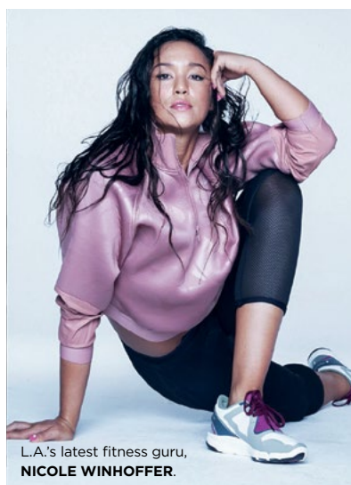
L.A.'s latest fitness guru, NICOLE WINHOFFER.