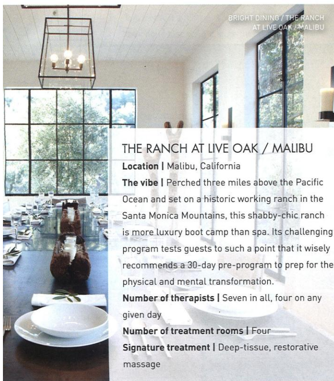
BRIGHT DINING / THE RANCH AT LIVE OAK / MALIBU