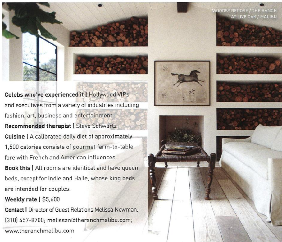
WOODY REPOSE / THE RANCH AT LIVE OAK / MALIBU

Signature treatment | Deep-tissue, restorative massage