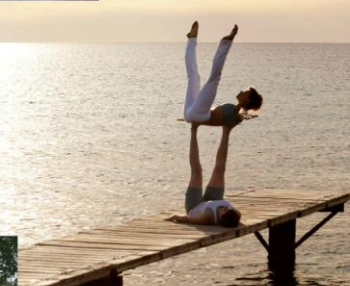
The Ranch at Live Oak