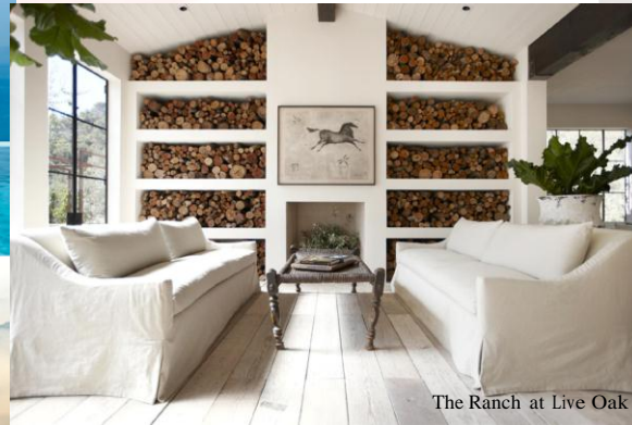
The Ranch at Live Oak