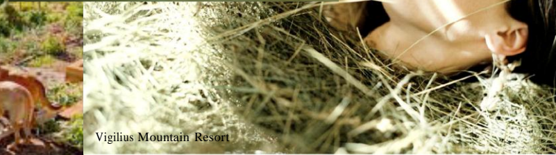
Vigilius Mountain Resort

Escape from it all this summer with a meditative, restoring break. These chic wellness sanctuaries offer seclusion and spirit-lifting settings that will rejuvenate the body and soul