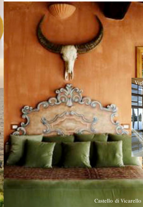
Castello di Vicarello