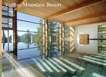
Vigilius Mountain Resort