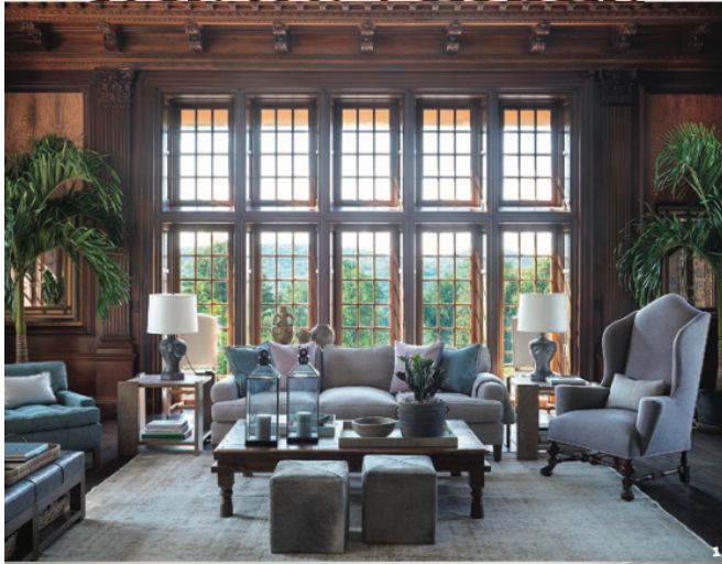
1. A LIVING AREA AT THE RANCH HUDSON VALLEY, DESIGNED BY AD100 TALENT STEVEN GAMBREL.