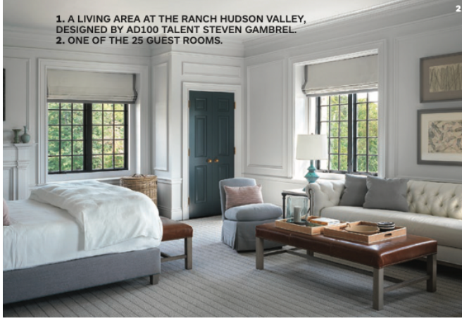
2. ONE OF THE 25 GUEST ROOMS.